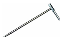
2x earth contact test probe (rod), 30 cm